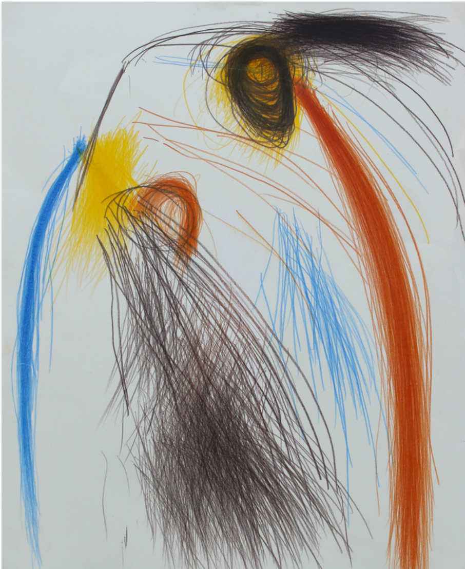
John Black, It's Birds. They are Flying, they are eating food, they are eating insects. They don't eat bread , 2018, Coloured pencil on paper, 52x64cm, 20.5x25.2 inches

This online exhibition offers the viewer a chance to discover the inner voice of eight self-taught artists from around the world – from loud splashes of colour, to hummed repetitive strokes, to hushed delicate marks. As many of these artists have varying verbal abilities, their choice of marks and the process behind each and every detail made conveys a meaning, telling us a story. Their art highlights their differences in language and delivery, but essentially they all communicate hidden and unheard stories or ideas. This might see us studying the back to front symbols and repeated lettering covering bold shapes of colour seen in Robert Fischer's drawings; the calming overlaid rhythmic swirls showing focused repetition and movement from Nnena Kalu or the colourful abstract floral imagery and treescapes blanketing John Maull's drawings. The actual process of making itself and the layering of marks is integral and plays a central role in each artist's composition. Their shared common aesthetic is their use of vivid colours and their non-conformist attitudes. Each artist becomes absorbed in the creative act, creating for their own needs: the fact we get to see their treasures is a real treat.