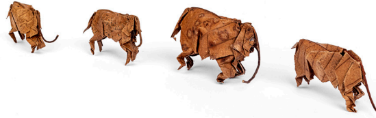
Yoshihiro Watanabe, Elephants , 2021, Leaf sculpture