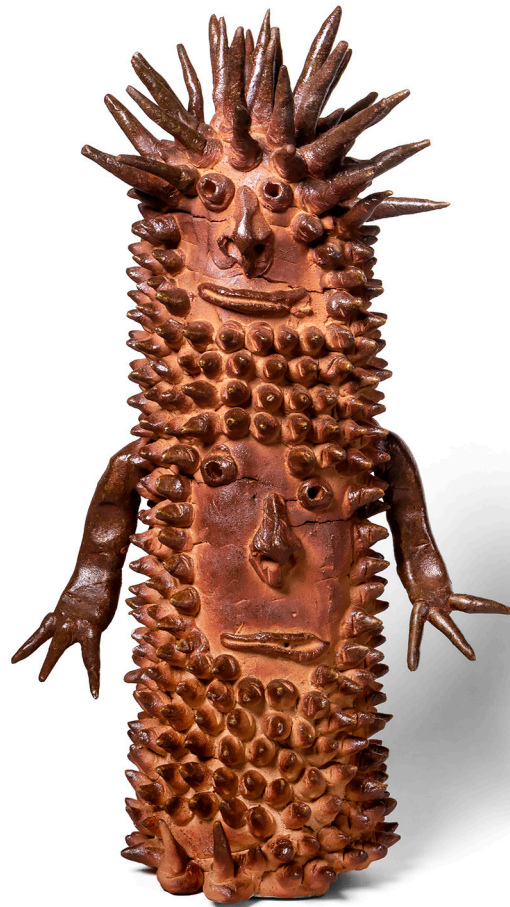
Shinichi Sawada, Untitled (14f) , n.d., Wood fired ceramic, approx 30cm tall