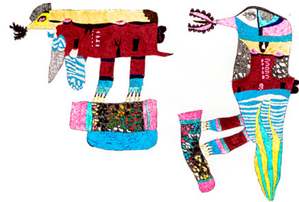
Untitled (20002), 2020 Ink pen on paper, 42x29.5cm