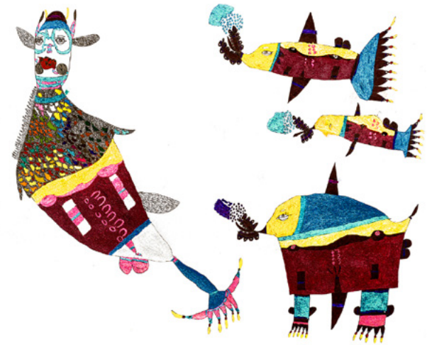
Untitled (20002), 2020 Ink pen on paper, 42x29.5cm