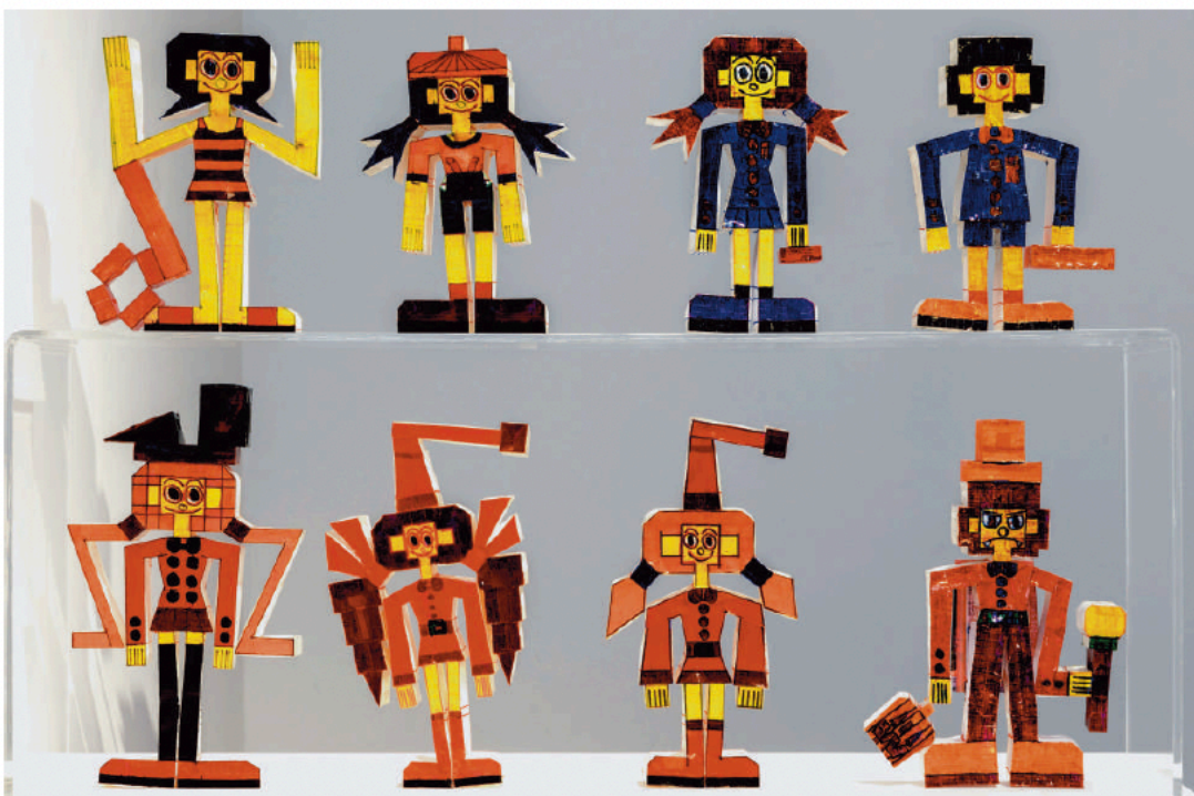
Keisuke Ishino, Untitled, 2018